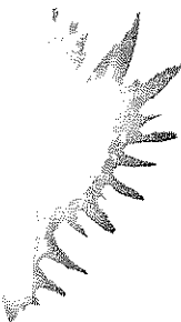
Abito, Angola, Africa. Nicaragua. Both \times 1 .